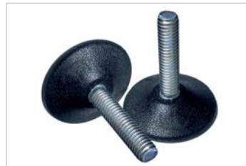
Adjustable Leveling Glides