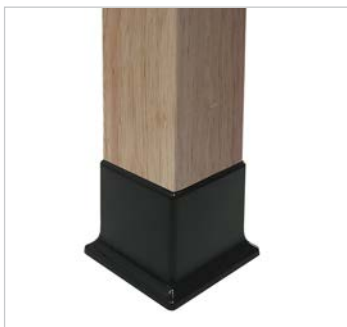
2 1/4" Solid Hardwood Legs