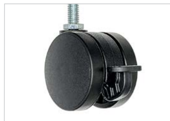
2 1/2" Swivel Casters