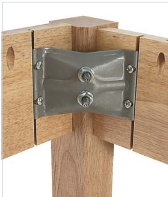
Premium Twin-Bolt Fastening System

Locking Swivel Casters: 2 1/2" swivel mounted locking casters. ( Order CA60B )