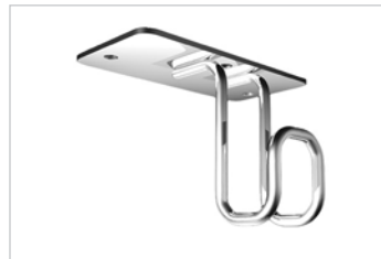
Back Pack Hook