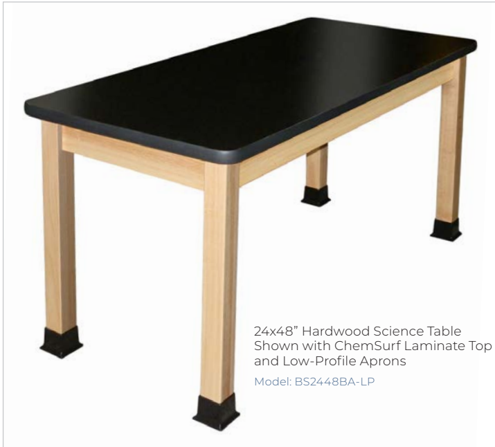
24x48" Hardwood Science Table Shown with ChemSurf Laminate Top and Low-Profile Aprons Model: BS2448BA-LP